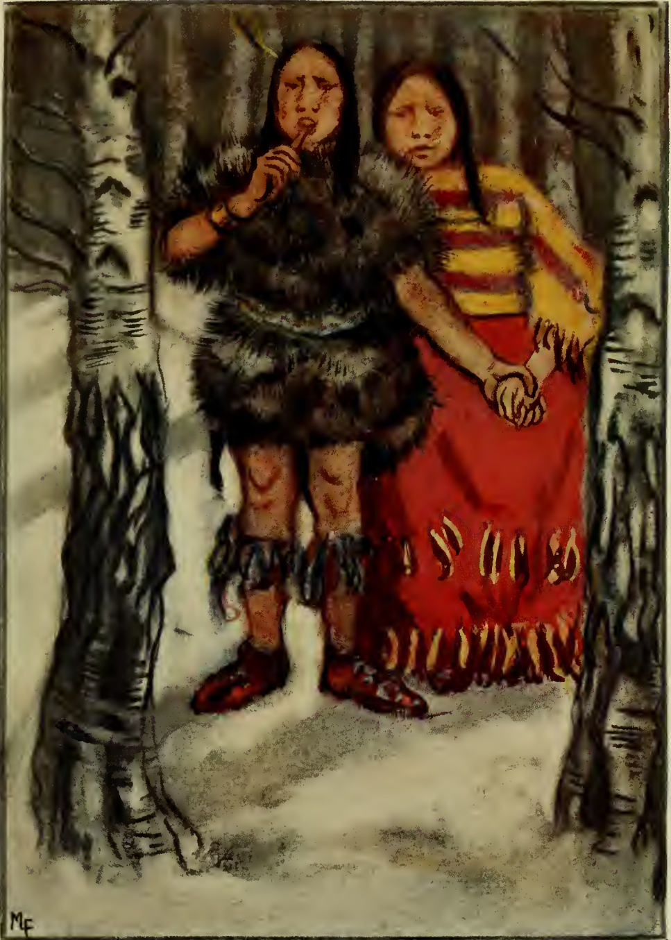
THEY STOOD FOR A TIME IN THE SHADOW OF THE GREAT TREES BEFORE THE DOOR AND MADE READY TO BLOW TOGETHER